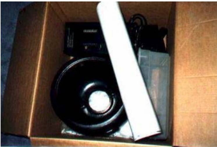
Every thing fits into box that is the stand