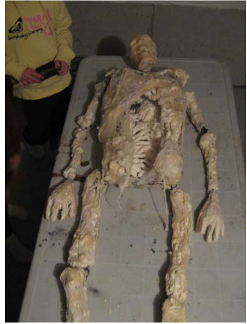
Initial Paint! 2 base coats Black in the joints and cappacino everywhere else...Left