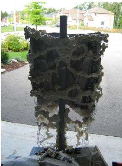
Here we are working on a simple Ribcage