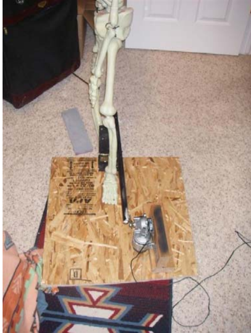
Other pictures of the mechanism from different angles.