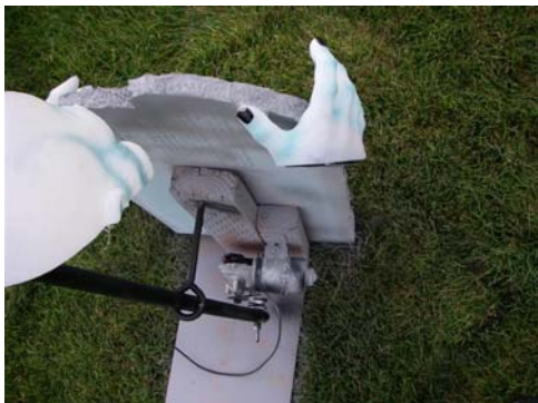
Top view of the mechanism

Step 5: The PVC then goes up through the eyehole, and the basic mechanism is finished. Place your head on the top, and your prop is ready to go. Just add any of your own personal touches to it.