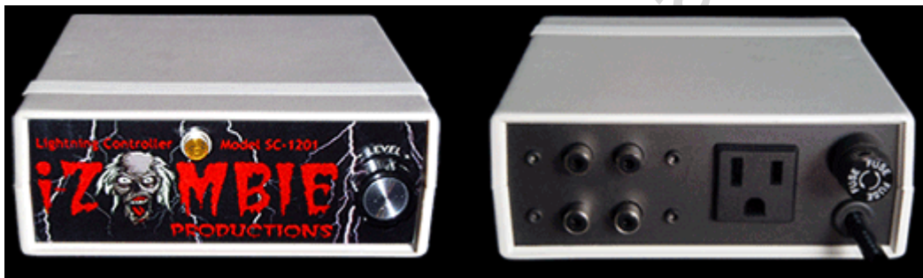
SC-1201 Single Channel Lightning Controller $119.95 [August 2006]

i-Zombie ( http://i-zombie.com ) manufactures three different models of high-power lightning controllers: