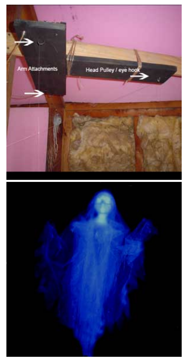
2007 UPDATE - This prop worked flawless for me during the haunt. I had no problems, and everyone loved it!