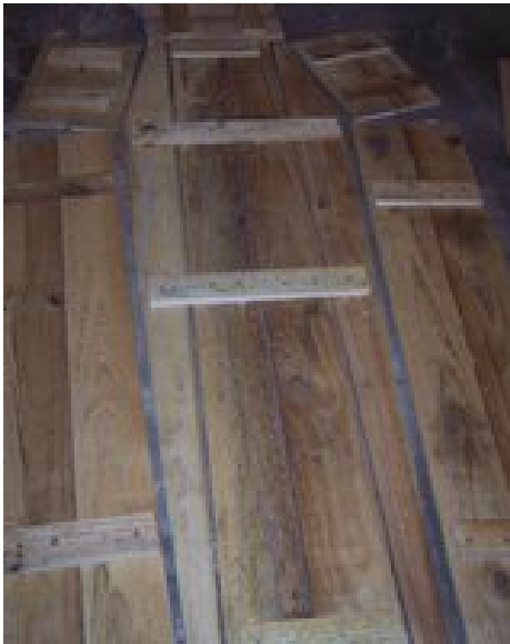
All the parts ready for assembly