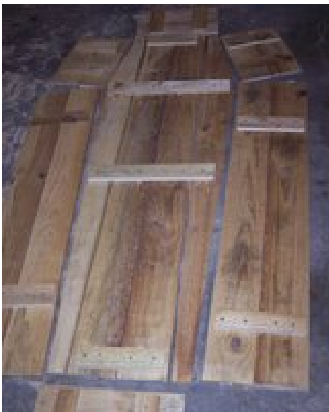
All the parts