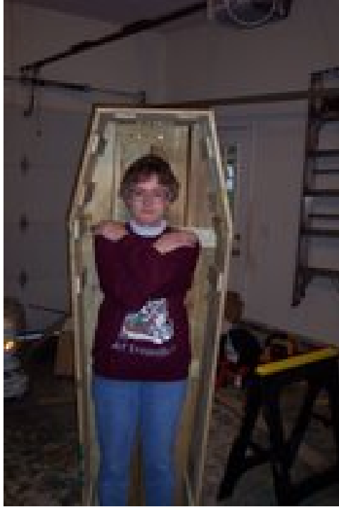
Taking a test drive. Our model gives it a try.