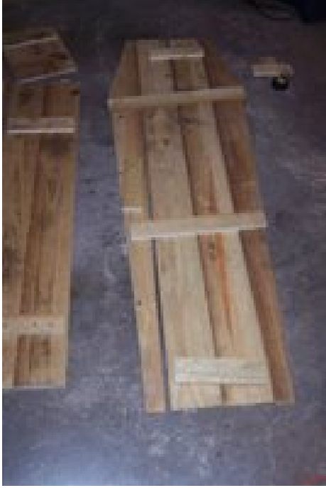
The top and bottom using the connectors