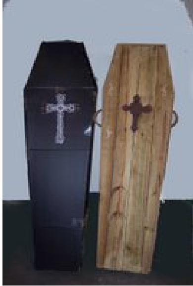
The finished product side by side with a cardboard version