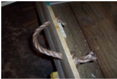
The coffin handles. A brown hemp rope is perfect