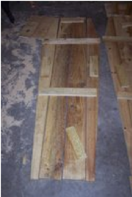
The top and bottom using the connectors