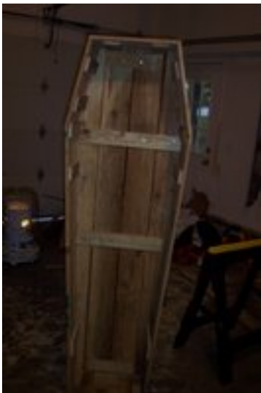
The finished bottom, sides, bottom, and top