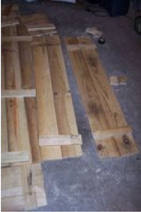
The sides using the connectors