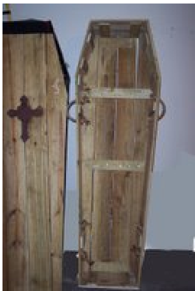
Finished product with the lid open