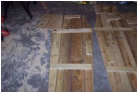
The top and bottom using the connectors