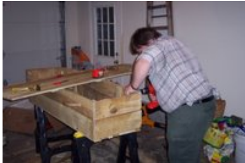
Assembling the sides using the 1" Dry Wall Screws