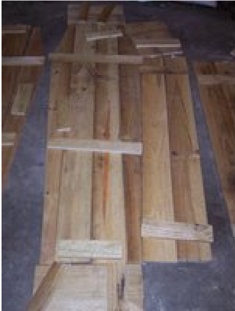
The Side Panels