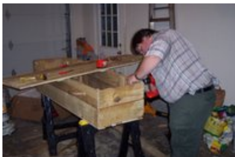
Assembling the sides using the 1" Dry Wall Screws