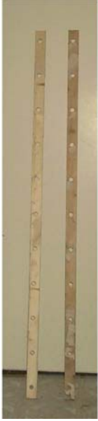
Figure 1 is hard to see but I ripped my boards down to a full 1" x 2" x 6' 2 1/2". All holes have been drilled out and pilot holes for the screws have been done as well. You can also tell I used wood putty to fill in some of the rough gouges...then it's off to the sanding and painting room. I use a belt sander to rough shape my pieces followed by a palm sander for finish work.