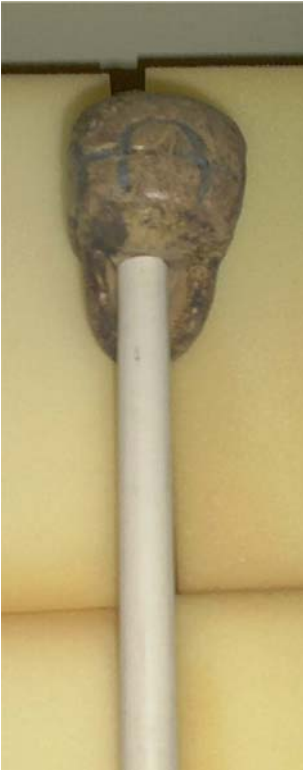
Figure 2 shows how I positioned the skull onto the post. I glued a #8 brad nail into each skull using PL300 foam board glue to avoid melting the Styrofoam skulls.

Figure 1 is hard to see but I ripped my boards down to a full 1" x 2" x 6' 2 1/2". All holes have been drilled out and pilot holes for the screws have been done as well. You can also tell I used wood putty to fill in some of the rough gouges...then it's off to the sanding and painting room. I use a belt sander to rough shape my pieces followed by a palm sander for finish work.