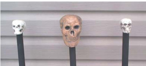
Figure 3 is the finished product...For 2006 I intend to make 6 to 8 more sections.

Figure 2 shows how I positioned the skull onto the post. I glued a #8 brad nail into each skull using PL300 foam board glue to avoid melting the Styrofoam skulls.