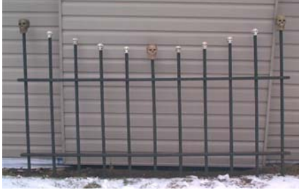
Figures 4,5,6 are just a better look at the skull finials.