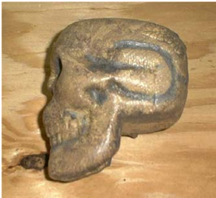
Figure 7 illustrates how the small skulls were packaged. I just cut them apart, pulled out the string, and glued away.