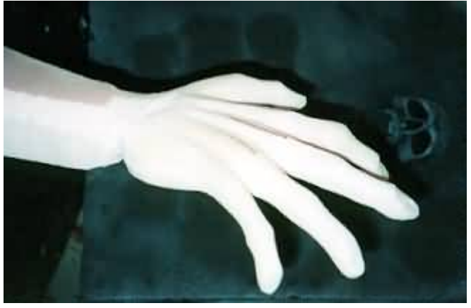
Then apply the monster mud,,,,,

I did not have the hands done at the time of this picture, But the hands should be in place before the