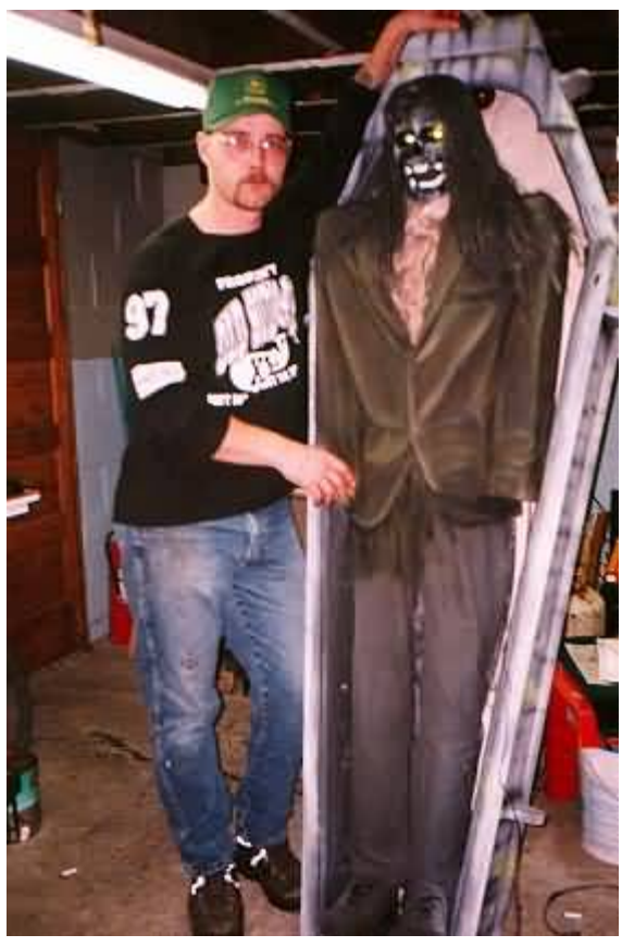
"" you can run the solenoid switch with a timer or just a plain old light switch......