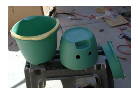
Part 2 - Cutting It Up

This image shows a unblemished bucket on the left, and what I did to it on the right. I used a skill-saw to cut off the bottom couple of inches and a 3/4" drill to cut the eye-holes