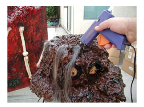
Part 6 - Hair

The finishing touch, to keep it from looking like just another "prop", was to add some hair. That way, people will dismiss it as a dog or something until they take a second look or see the glowing eyes. Hair can be added really easily, in my case I found a witches hat with silvery-grey hair attached for $2, so I purchased it, cut off the hair and threw the hat into the "parts" bin.