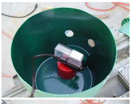
Part 3 - Wiring It Up

This image shows the simple wiring system I employed. Basically I use a night-light connected to a extension cord. The night-light sits up on a spray can lid to position the light behind the holes.