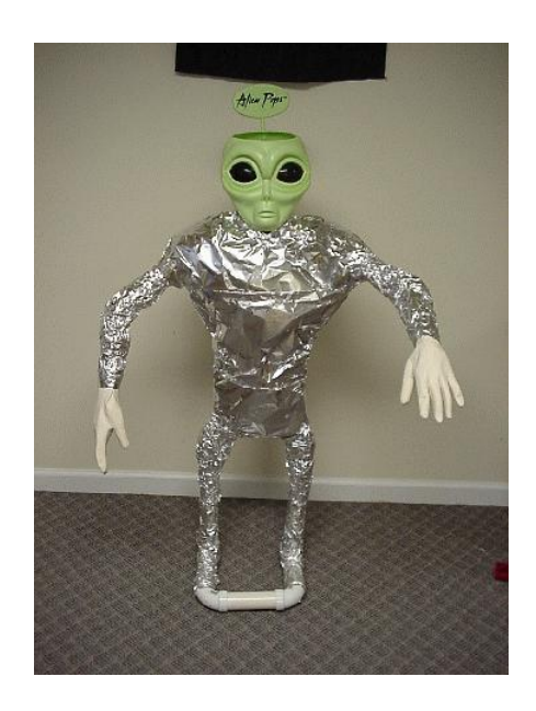
STEP 3 Wrap the pvc pipe with aluminum foil.

CONGRATULATIONS! Your done and he is ready to hang out and party!