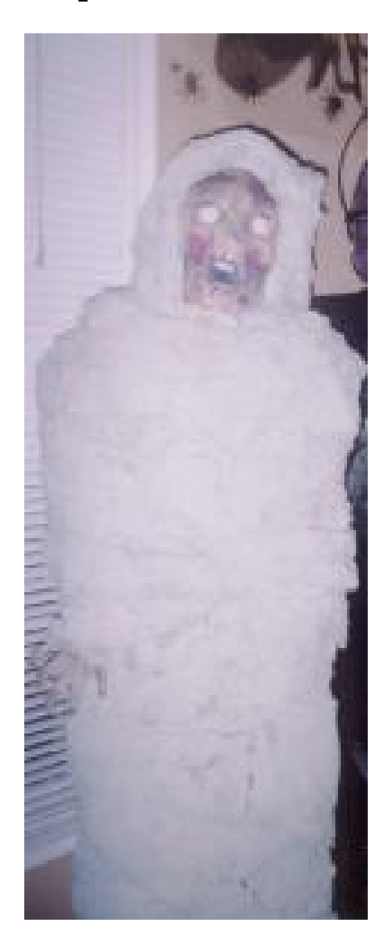
Step 3: Latex Paint and Webs

I covered the cotton in latex paint tinted greyish-green. It hardens it up pretty well. And finally, I stretched webbing around it and covered it in spiders.