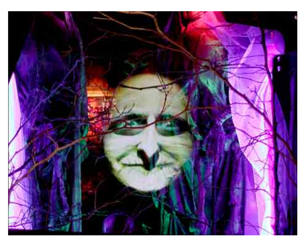
with a much more elaborate scene set-up in the background. Your imagination is the only limit!