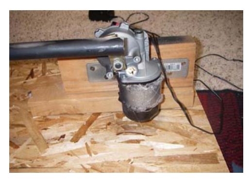
Step 2: Mount the motor to one of the 2X4's. There won't be a need to replace the crank arm for this prop.

The second screw I placed several inches higher, through the wood, into the PVC. This is easier if you predrill the holes. This secures the PVC to the hinge, and the hinge to the plywood base. This PVC is what you'll place your blucky over.