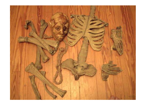
Pile of bones. The head will not be used, instead, I'll use the one that came attached.