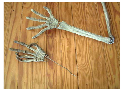
Viola! Poseable hands.