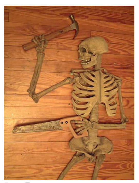
Ready to work