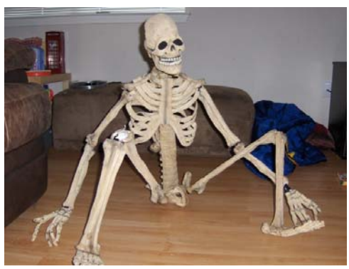
You can now see how well the once floppy guy now will sit up on his own.