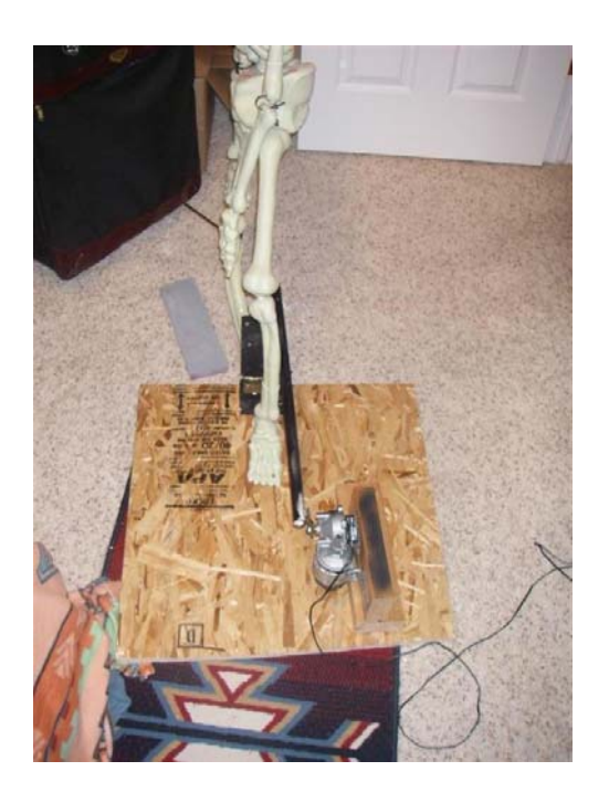
Other pictures of the mechanism from different angles.