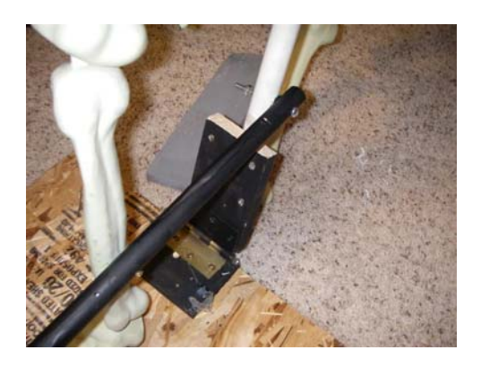
Step 5: The end of the crank arm on the motor has a small ball. In one end of the 23" 1/4" PVC, you want to drill a hole just big enough to be able to force the end of the PVC over that ball. If you get the hole too big, then it won't stay on. If you have trouble getting it over the knob, but can manage with some taps with a hammer, then it's about right. I used a 5/16" drill bit, and slowly enlarged the hole, until I could force it over the knob. On the opposite end of the PVC, but on the same side, drill a normal hole with the 5/16" drill bit.

Step 6: With that same drill bit, drill two holes in the 3/4" PVC at 7" and 10 1/2" from the bottom of the PVC.