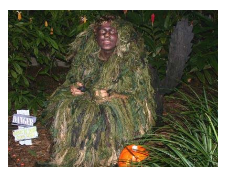
The face is camouflaged with brown and green makeup.