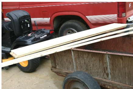
Here is the bottom of the casket before being cut.