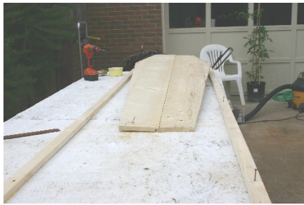
Here is the top of the casket