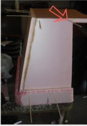
Trim excess once set